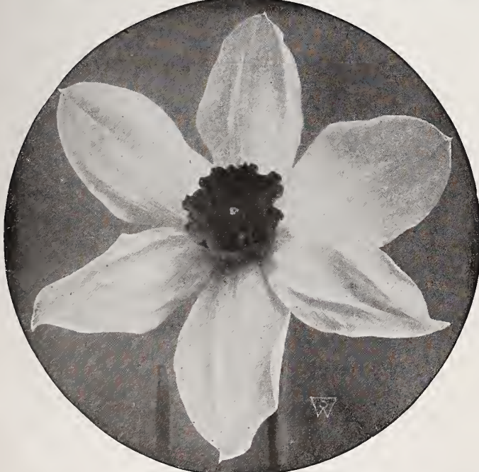
Medium Trumpet Narcissus, Lucifer

Great Warley. (Incomparabilis.) Broad, massive perianth of creamy white, fully 5 inches across when well grown; rich golden yellow crown, 1 1/2 inches wide. A very striking and beautiful flower. Height 18 inches. $1 each, $10 per doz.